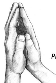
Praying hands flag